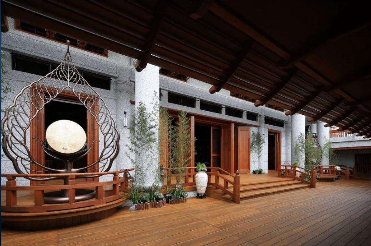
The large Taiko drum in the Main Hall at Jing Si Abode in Hualien. Photo by Hsiao Chia-Ming February 8, 2013