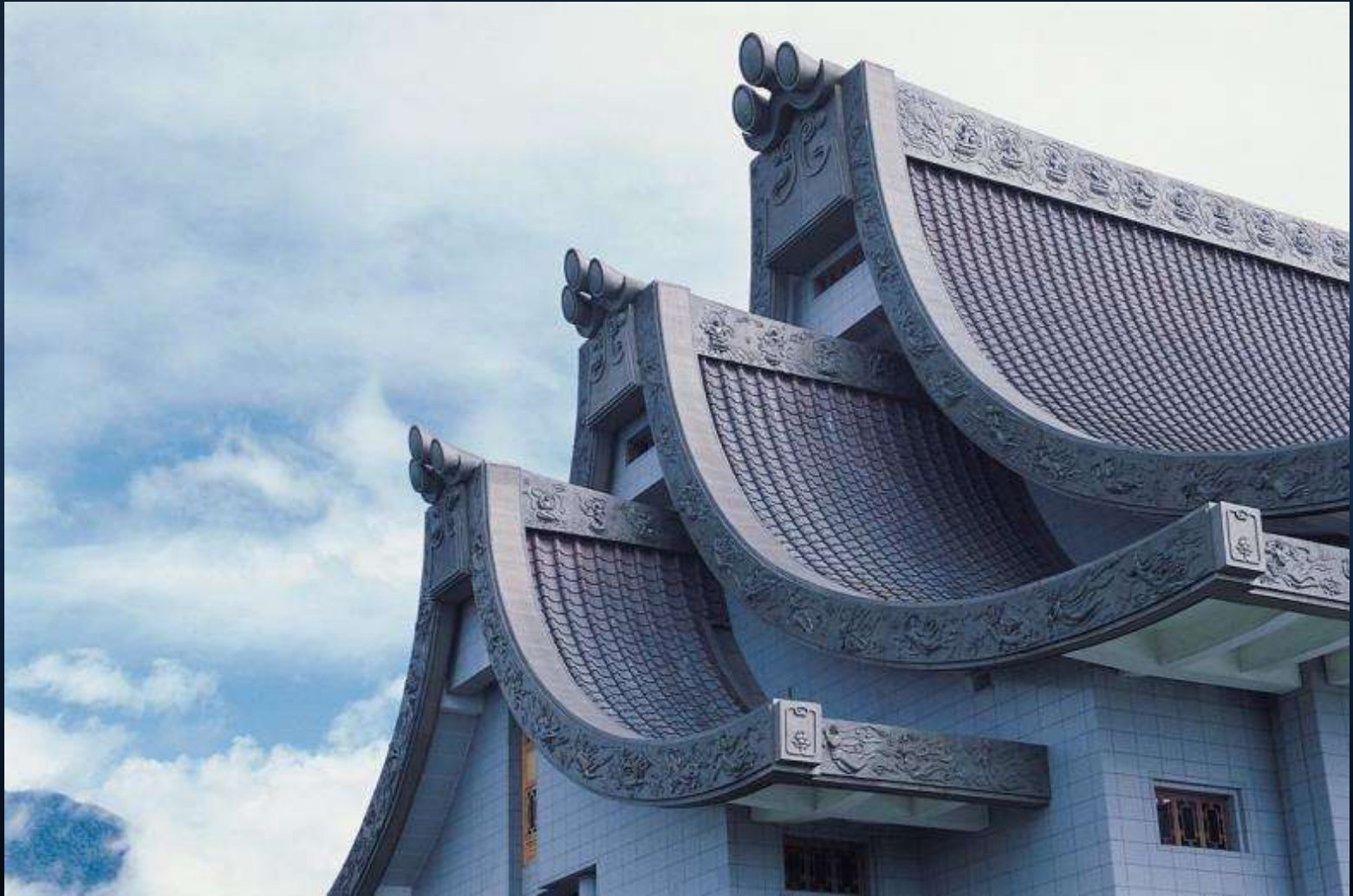
The Three Treasures finial at the ridge ends on the roof of the Jing Si Hall in Hualien.