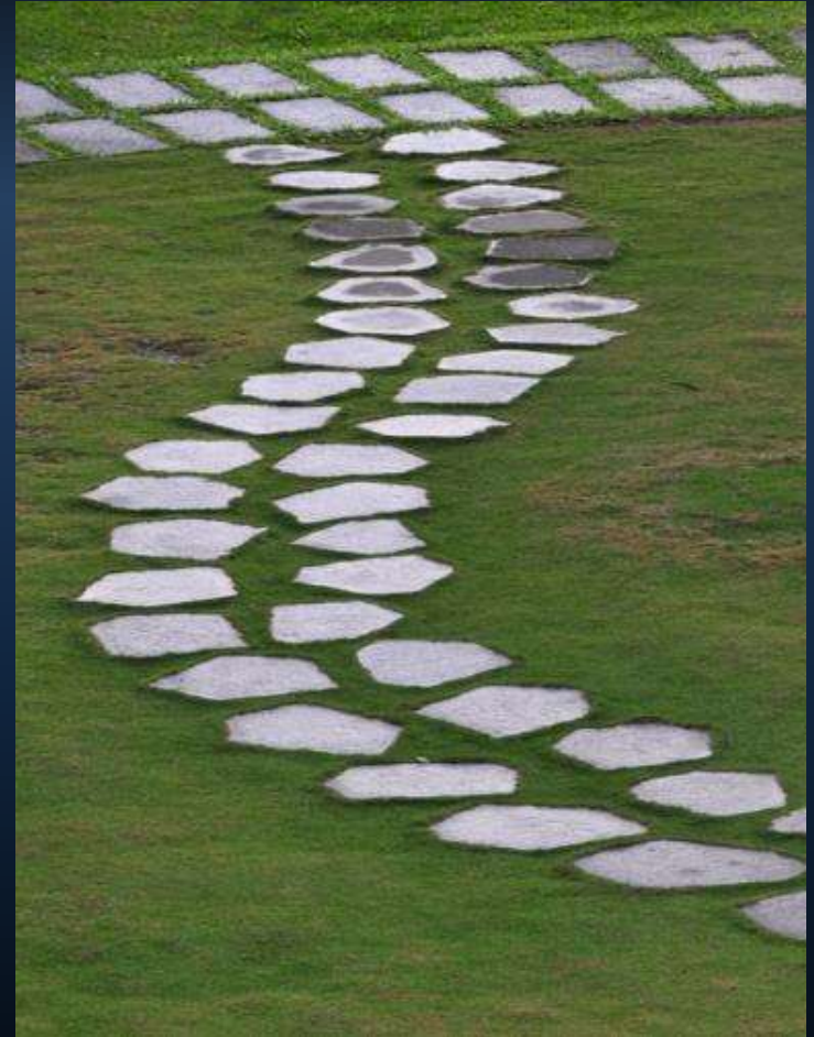
The garden path at Jing Si Abode in Hualien.

Photo by Wang Hsien-Huang September 19, 2013