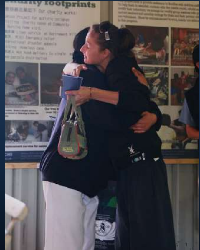
March 24, 2012

A Tzu Chi volunteer and a resident hug warmly.