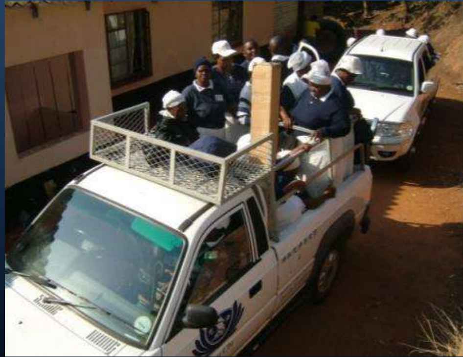
Volunteers in Durban, South Africa making home visits and distributions. August 14, 2008