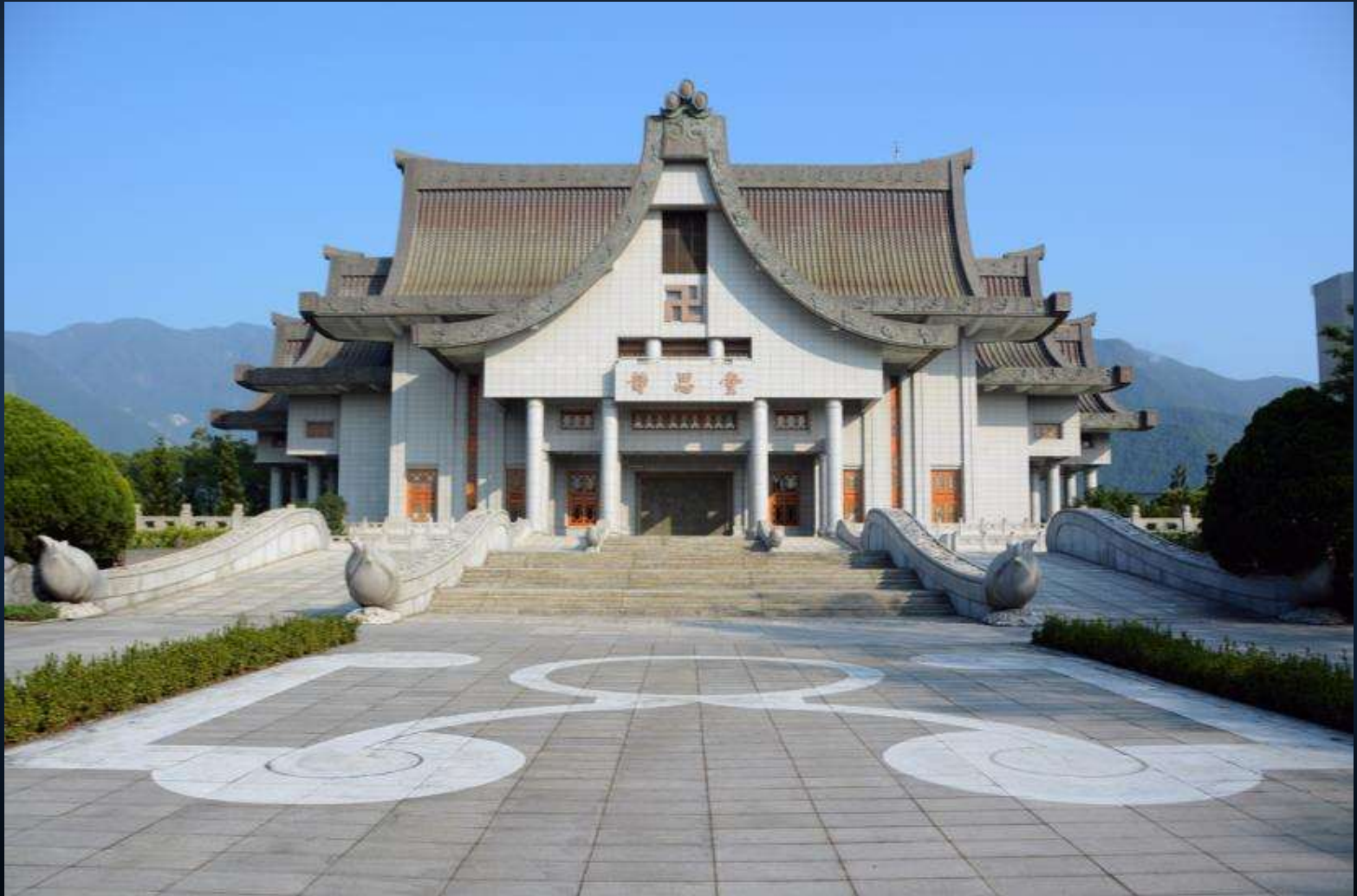
The external appearance of the Jing Si Hall in Hualien. April 18, 2014