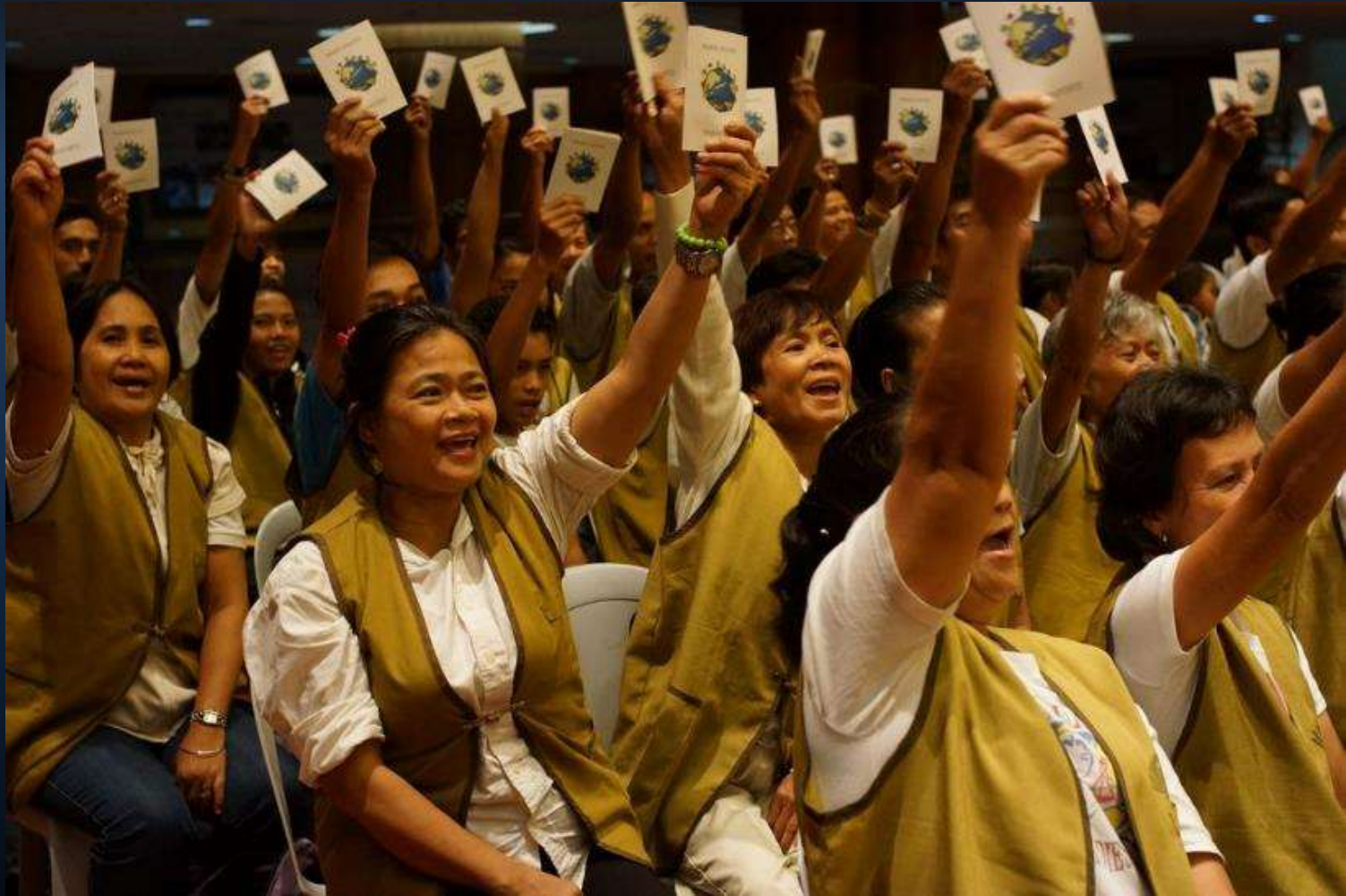
Local Volunteers who attended volunteers training sessions were enthusiastic about having a vegetarian diet and supporting the Veggie Country Passport. March 25, 2012.

The pure truth, goodness, and beauty of human nature is no need to make distinction among races, religions, etc.