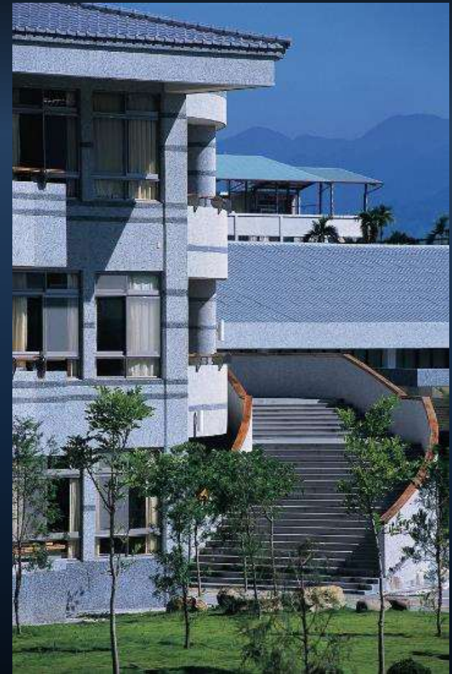
“Project Hope” of Buddhist Tzu Chi Foundation – Puli Elementary School, Nantou.

August 13, 2002