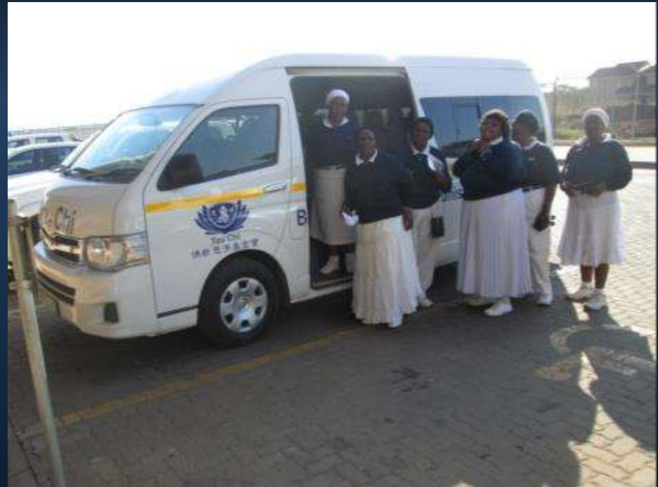
Volunteers from Durban, South Africa going to Swaziland to provide help with distributions. The new vehicle, called New Tzu Chi No. 3, enabled volunteers to reach people far and wide and to inspire more people to give with love. Photo provided by Gladys Ngema June 20, 2013