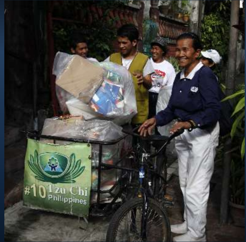
March 19, 2011