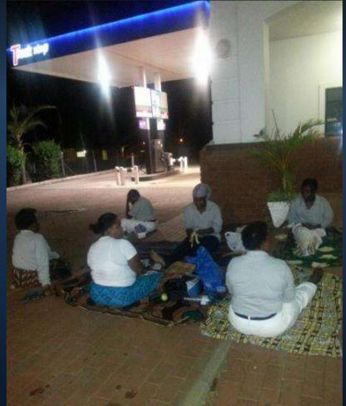
August 13, 2013

After participating in a local leadership training session in South Africa, volunteers from Mozambique were too late to cross the border to get through customs, so they slept in front of a gas station near a convenience store.