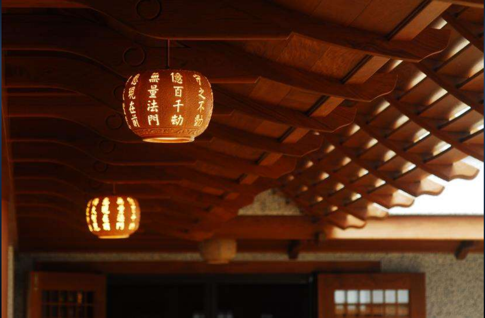
The pottery light in the Main Hall at Jing Si Abode in Hualien. July 7, 2012