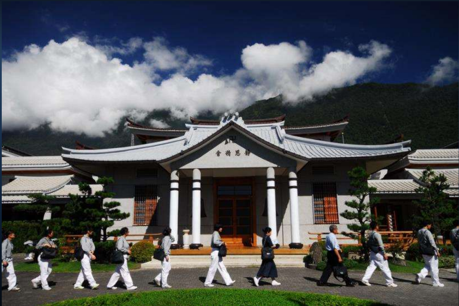
Tzu Chi volunteers line up in ranks to visit the Jing Si Abode in Hualien. July 7, 2012