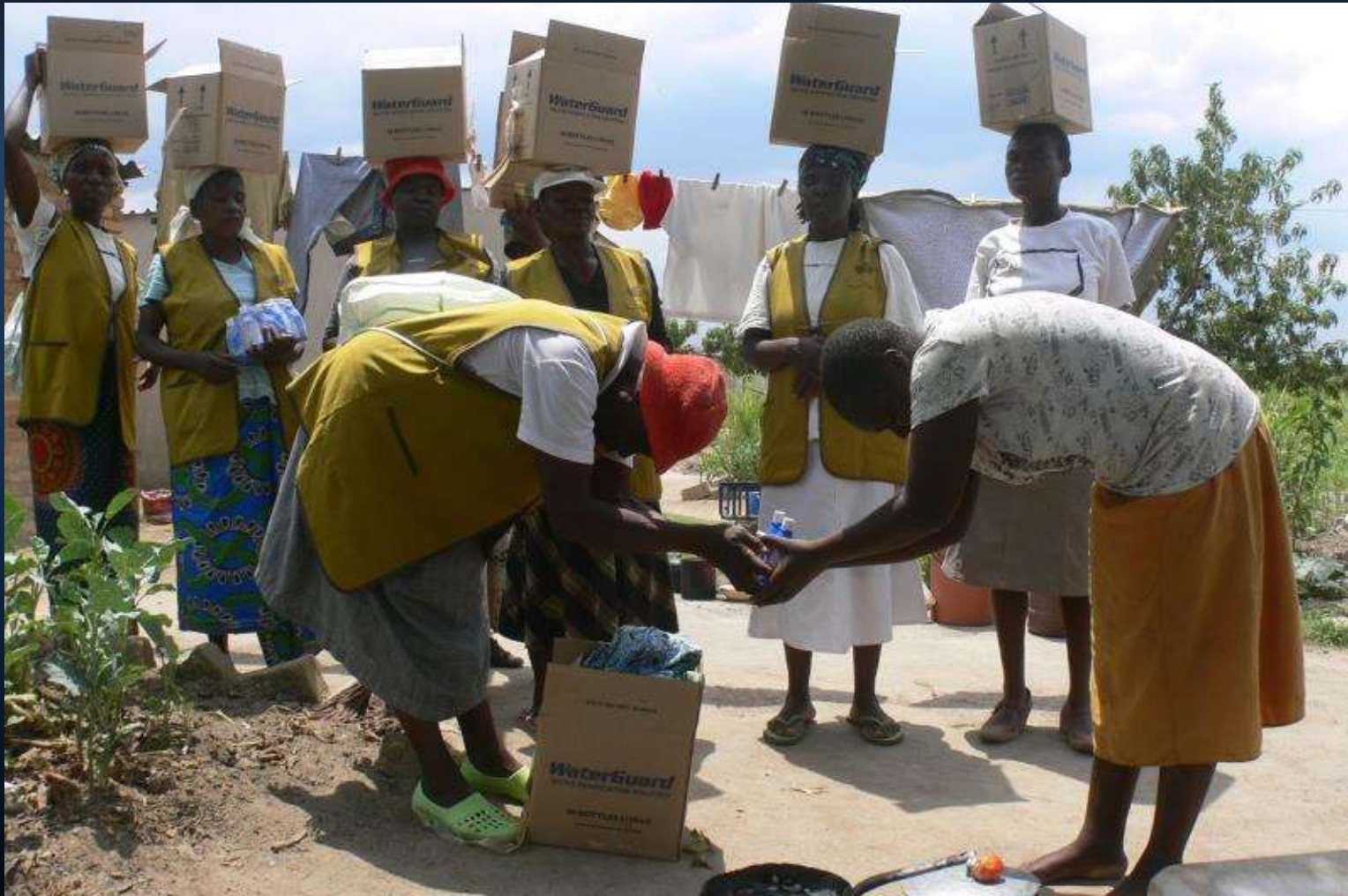
Tzu Chi volunteers distributing purification liquid bottles to locals in Zimbabwe. Photo provided by Chu Chin-Tsai November 8, 2013

The Tzu Chi path is not a smooth ride, but volunteers in Africa never give up.