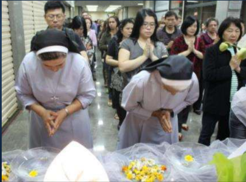
Tzu Chi volunteers held a Buddha Day ceremony in Ciudad del Este, Paraguay. Nuns from Hogar de Anciano San Agustin attended the ceremony with sincere hearts. May 11, 2014

The pure truth, goodness, and beauty of human nature is no need to make distinction among races, religions, etc.