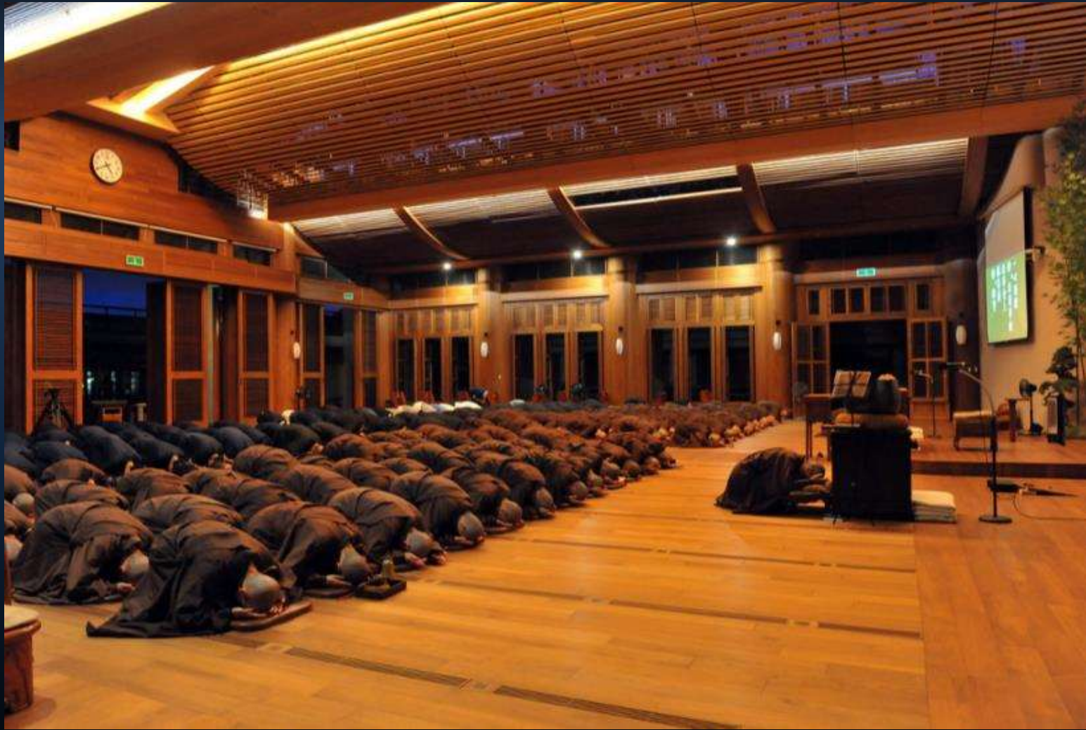
The morning recitation at the Jing Si Abode in Hualien. May 28, 2012