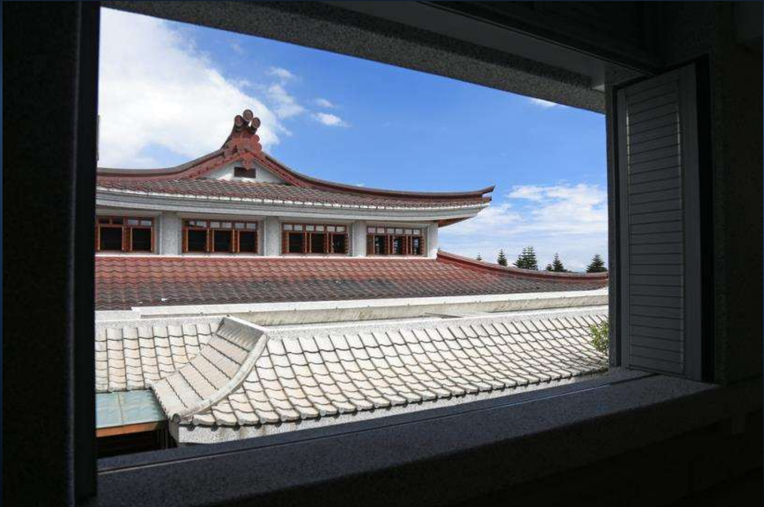
The view of the main Buddha Hall eaves at the Jing Si Abode in Hualien. February 7, 2013