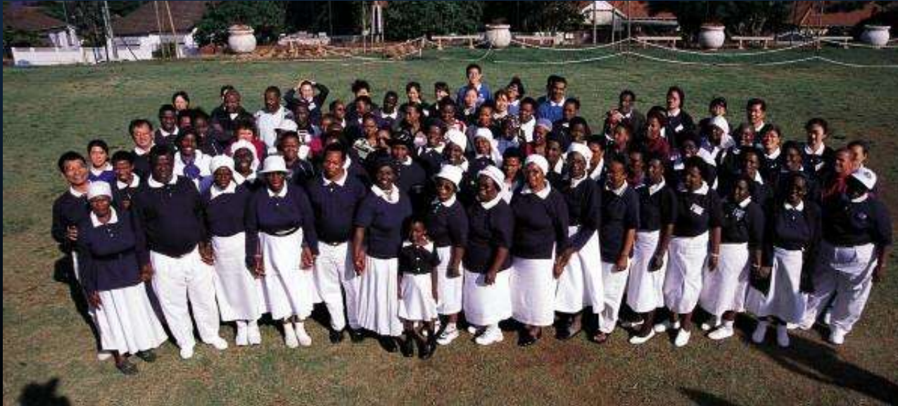
July 12, 2002

Tzu Chi volunteers from South Africa provide help for the local needs and have started to sprout and grow in Swaziland and Mozambique. They are sustained by a strong sense of commitment. They staunchly march forward on the path of helping the needy. Despite being in difficult circumstances themselves, they radiate light and warmth through their benevolent and altruistic actions. They shine as brightly as black pearls.