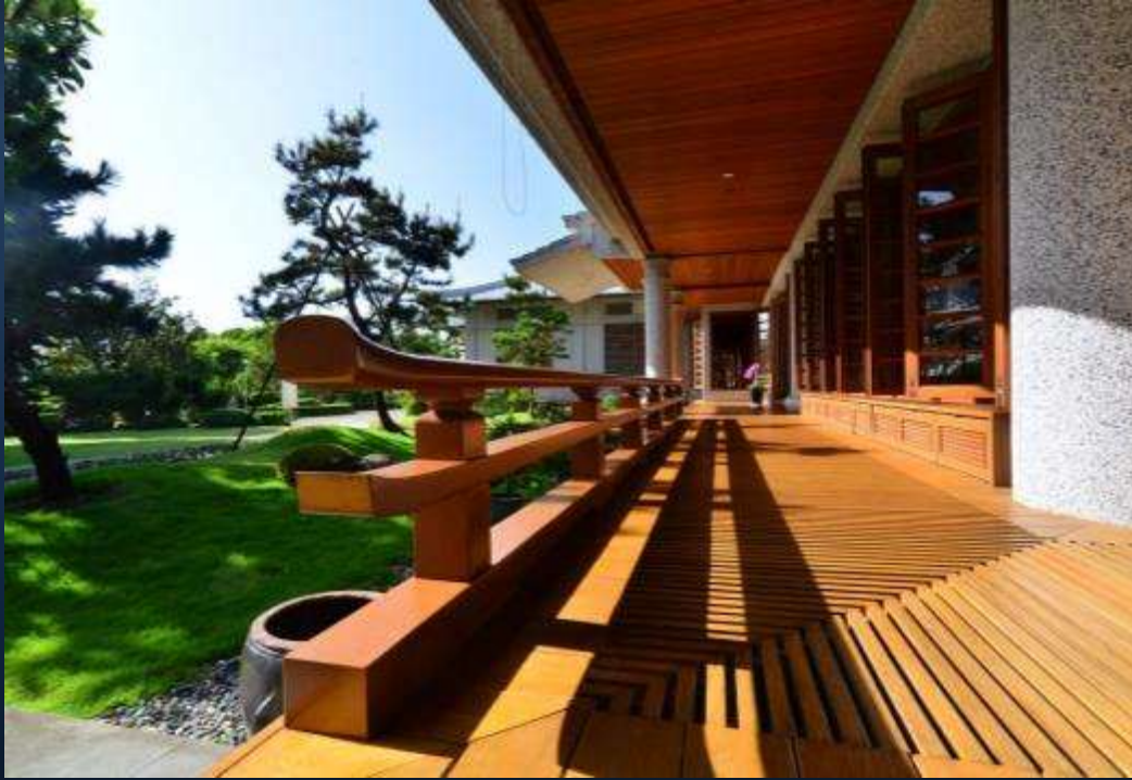
The view of gallery in the Main Hall at Jing Si Abode in Hualien.

September 19, 2013