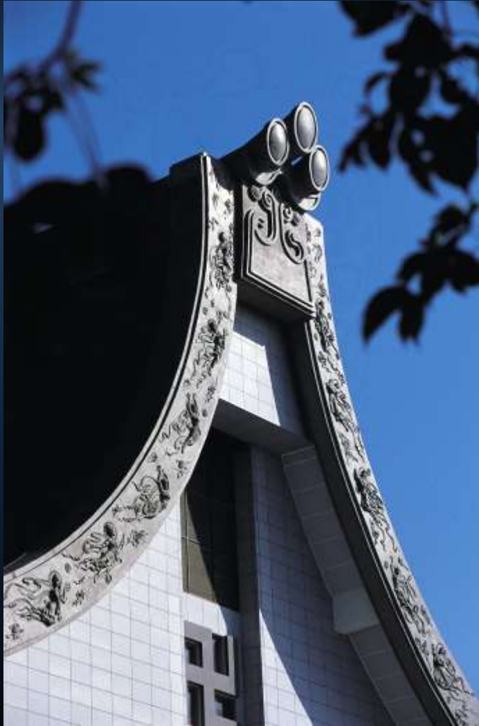
April 28, 2001