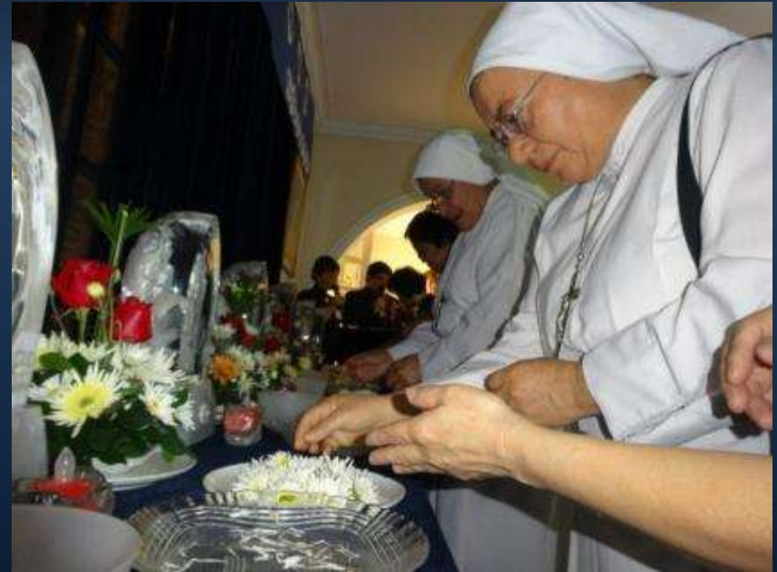
Tzu Chi volunteers held a Buddha Day ceremony in Asuncion, Paraguay. Nuns attended the ceremony with sincere hearts. May 11, 2014