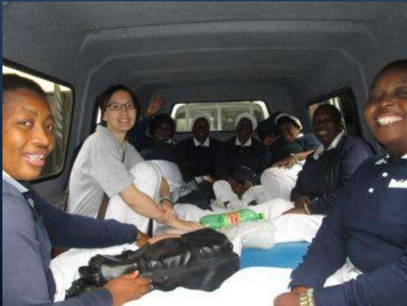
A group of Tzu Chi volunteers from Durban going to Mozambique to visit homes of the poor with volunteers from the local area to begin charity work in Mozambique. April 20, 2013

The Tzu Chi path is not a smooth ride, but volunteers in Africa never give up.