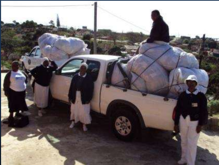
Volunteers in Durban, South Africa making home visits and distributions.

A truck filled with goods is the most important tool for volunteers to visit and distribute aid to the care recipients.