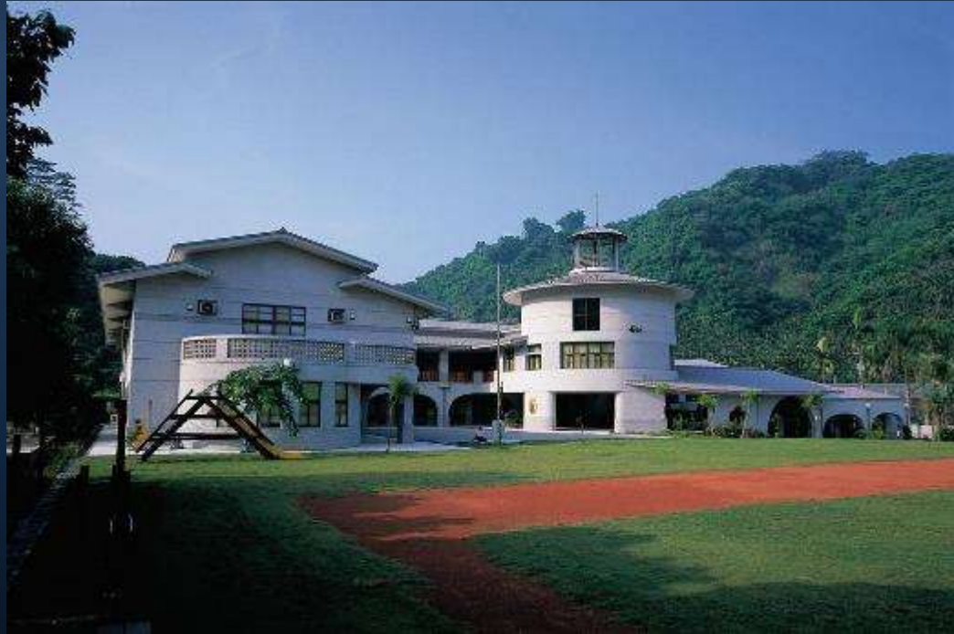
“Project Hope” of Buddhist Tzu Chi Foundation – Tong-Lin Elementary School, Wufeng District, Taichung City